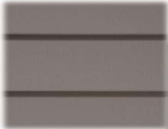
Weathered Wood Accent Color

Siding Project Preview Here's a preview of the materials the Board & the Siding Committee has selected for our exterior upgrade - garage door, vinyl siding and balcony railing. More information will be sent out for your review very soon!