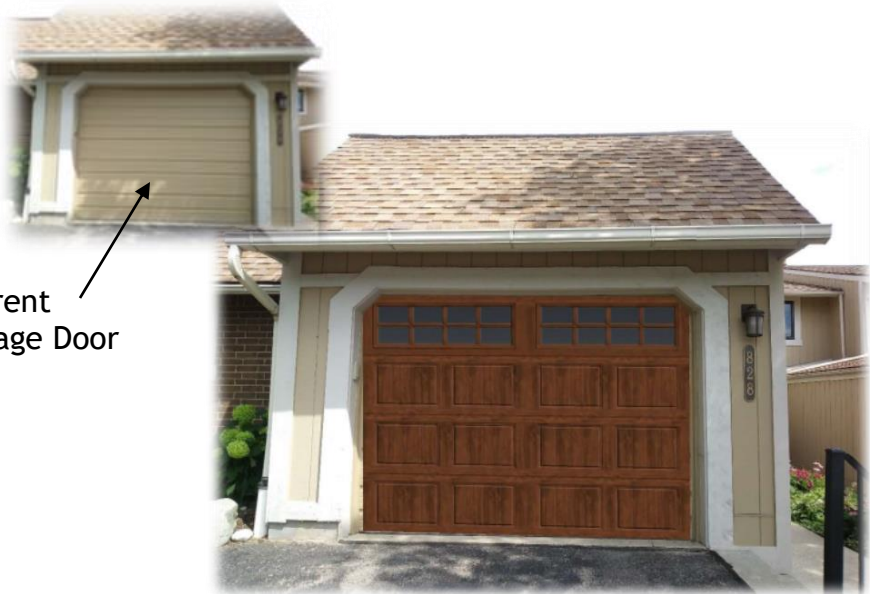
Current Garage Door