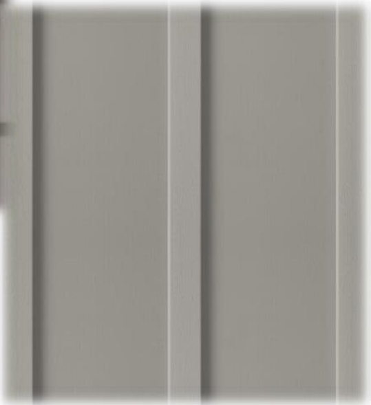
Granite Gray Main Color